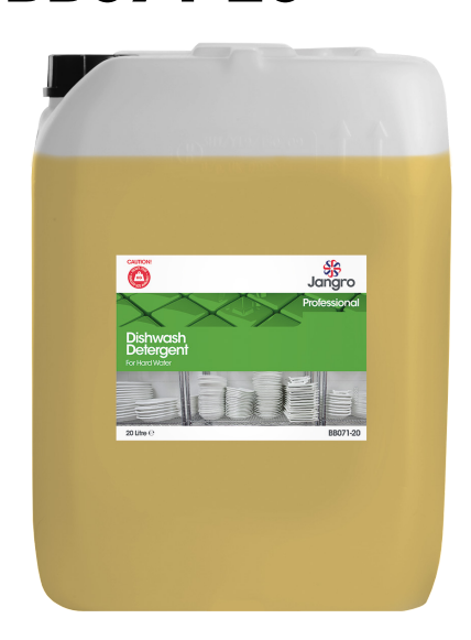
Areas of use