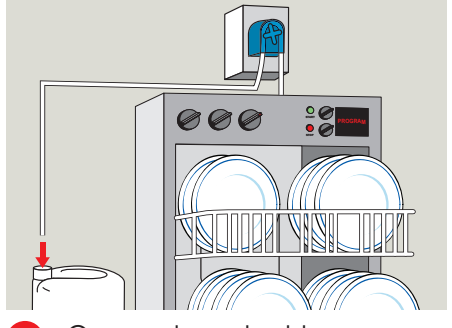
Connect product to electronic dosing system following manufacturers instructions.