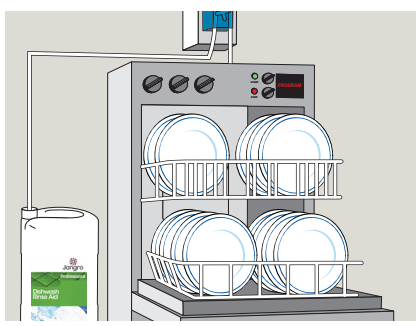
Product should be diluted at the rate of 1-2ml of rinse aid per litre of water.